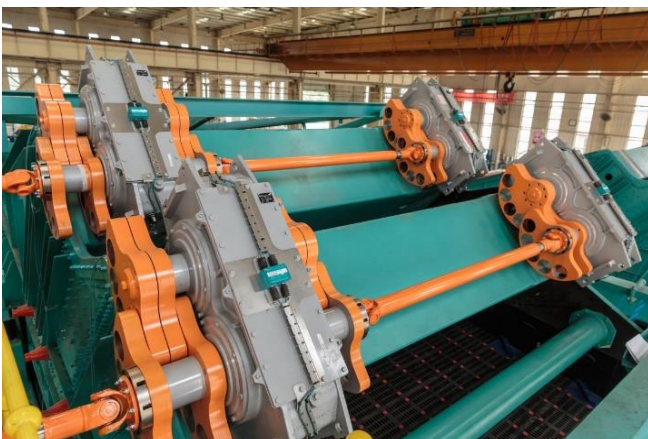
Picture: SLK4390WXFS vibrating screen equipped with the CONiO condition monitoring system.

With an installed mass of 120 tonnes, a vibrated mass of 72 tonnes and exciters that generate a combined force equivalent to fourteen “maxed out” jumbo jet engines, there is no surprise the screen has been nicknamed “The Beast”.