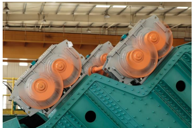
Picture: DF704 Exciters mounted in pairs on two exciter Beams.